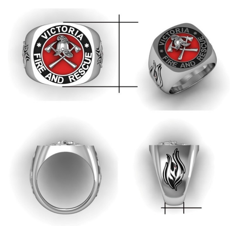
Victorian Fire Service ring clearance sale only $59 Including delivery.