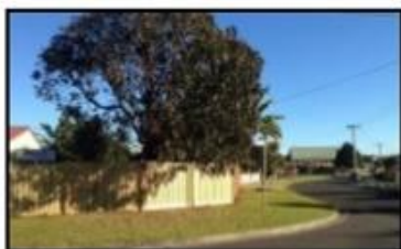
24 Roditis Drive, Ocean Grove