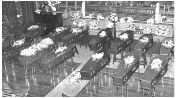
Above; The 15 coffins lined up inside the Salvation Army Temple prior to the service for the homeless who died in the fire.

At the conclusion of the service the fifteen coffins were taken out and placed in fifteen hearses in Bourke Street. Exhibition and Spring Streets were blocked off to traffic. The congregation were asked to line up behind the hearses. This included the Salvation Army Band, Salvation Army personnel, MFB representatives, Police, St John's ambulance officers, doctors and nurses from